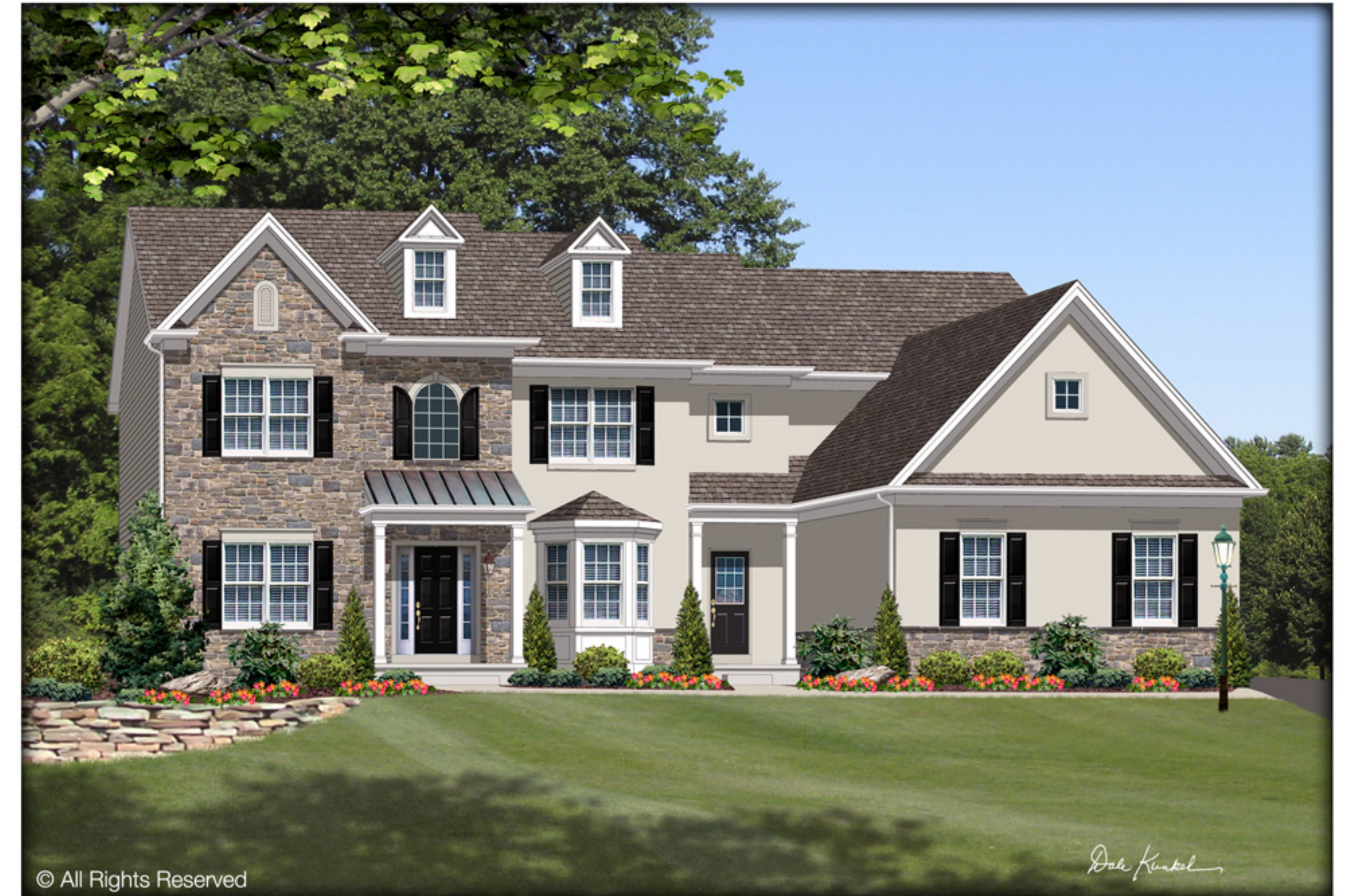
The Weyhill Country Manor

Welcome to Colonial Walk Estates. The Portland Group offers custom built homes to suit your lifestyle in this exquisite country setting with one acre plus home sites in beautiful Bushkill Township and Nazareth school district. Conveniently located, with easy access to major routes as well as necessities of everyday life, Colonial Walk Estates is only a few miles away from Jacobsburg State Park and serene Bushkill Creek.